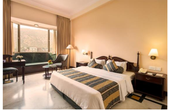
KK 皇家酒店及会议中心或同级 KK Royal or similar http://www.kkroyalhotel.com/ 阿梅尔, 斋浦尔 Amer Rd, Amer, Jaipur